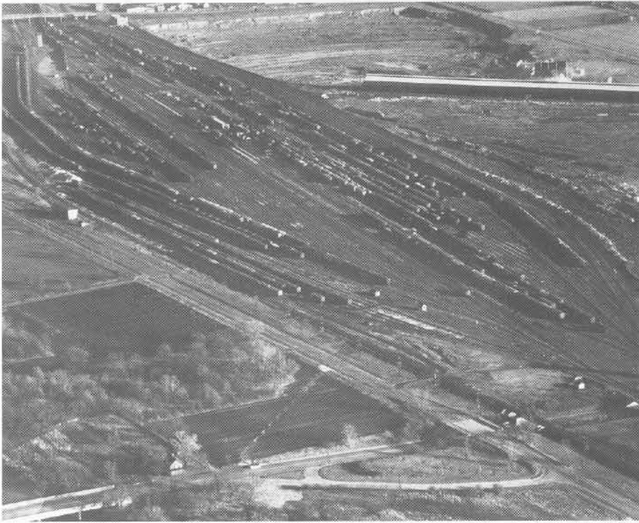
Docksides, yards, other areas subject to heavy loads use steel slag for both surface and sub-ballast.