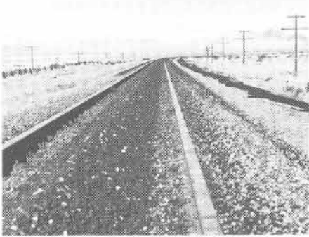
Steel slag is used for dressing and for raising rails on major Western main line near California-Nevada border.