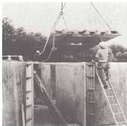
Floor-ceiling panel is guided into place.