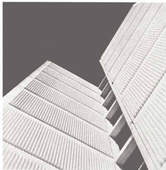
Exterior surface of concrete wall panels has sculptured finish.