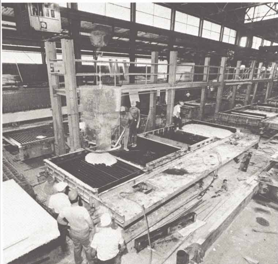
Workers at Strescon Industries pour finish layer of concrete in wall form.

"The result is improved interior temperature control and more effective acoustic separation created by the 7 in. thick reinforced concrete walls between rooms. The cellular floor panels are 8 in. thick and include an acoustic bottom that becomes the pre-finished ceiling of the room below," says Charles Luckman, president of Ogden Development.